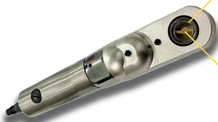
REF. 160 T200