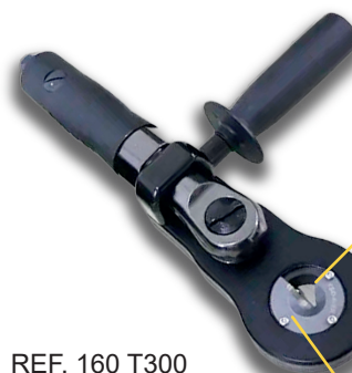
REF. 160 T300

INSERTO AFILADOR NEUMÁTICO PRO G20 CUTTER BLADE FOR DOUBLE SIDES TIP DRESSERS REF. 161 INS2CG20